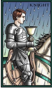
Knight of Cups